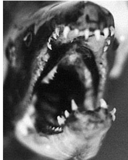
Fig. 1. Frontal view of sockeye salmon teeth sampled in this study. Three teeth on each side of the midline of the upper and lower jaws were measured for a total of six teeth from each jaw.

Sampled fish were measured for body length (mid-eye to hypural plate to avoid bias from variation in jaw length between sexes and among populations), body depth (dorso-ventral distance, from the anterior insertion of the dorsal fin to the belly), jaw length (mid-eye to tip of upper jaw), tooth length and skin mass. The heads and a skin sample approximately 2 cm 2 , including the dermis and some underlying muscle tissue were removed from each fish and stored frozen until